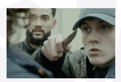
Why do young people carry knives?

Explain many of those who carry knifes say initially they carried them for their own protection. Evidence shows that those who carry knives for their own protection are more likely to become a victim as a result, and the knife can be turned on them. https://www.wirralsafeguarding.co.uk/knife-crime/